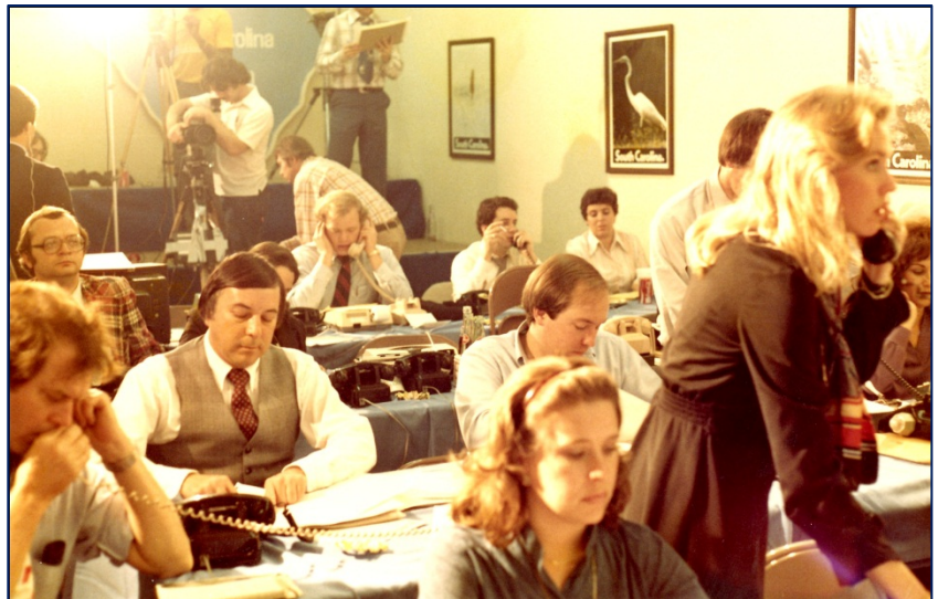
The press reporting the election of 1980

Early Republican attempts at the governorship proved unsuccessful for Joseph Rogers, who ran against incumbent Democrat Robert McNair in 1966, and Albert Watson, who could not beat Lt. Governor John C. West for the position in 1970. It wasn’t until 1974 that James B. Edwards defeated Gen. William Westmoreland in the primary and the Democratic candidate, former Congressman W.J. Bryan Dorn, in the general election to become the first Republican governor of South Carolina since Reconstruction. Four of the six governors since then have been Republicans.