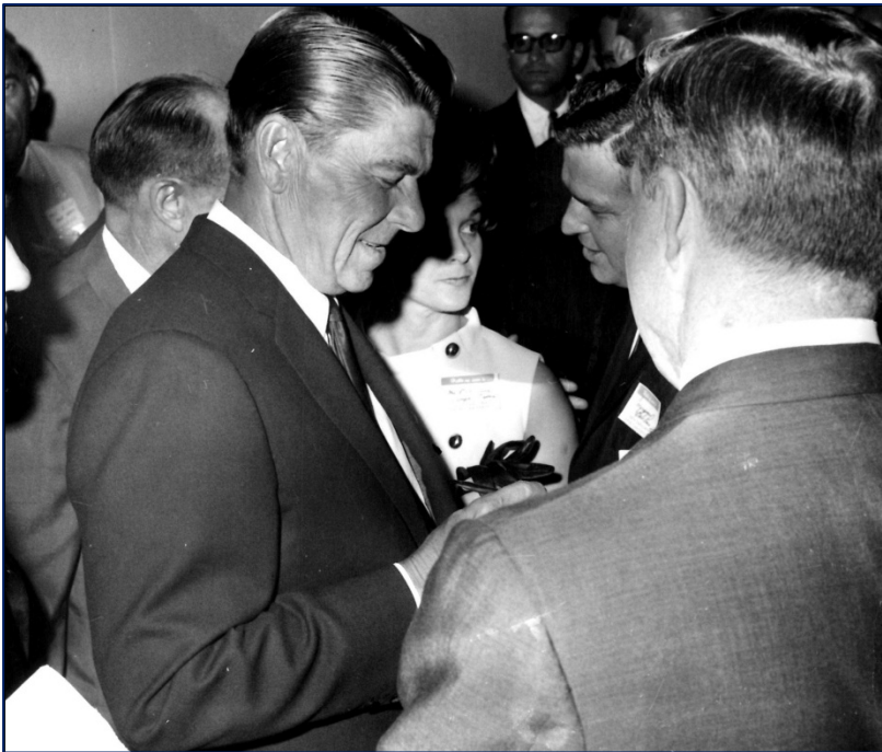
California Governor Ronald Reagan visits South Carolina in 1967

Audio-Visual materials consist of cassette tapes, VHS tapes, and photographs. Items are arranged by format. Cassette and VHS tapes include party campaign ads and GOPAC training materials. Photographs include party events, officials, and members, including shots of an Eisenhower rally, c. 1952, and a visit to South Carolina by California Governor Ronald Reagan in 1967.